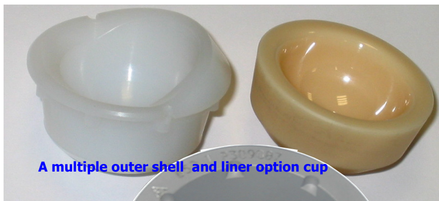
A multiple outer shell and liner option cup

Fluide tight screw holes and apical dome hole with porous sterile titanium plugs.