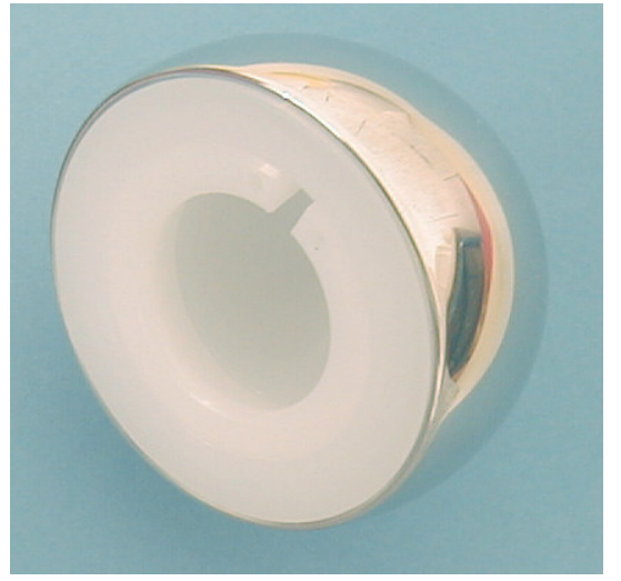
Bi-polar cup with ring locking