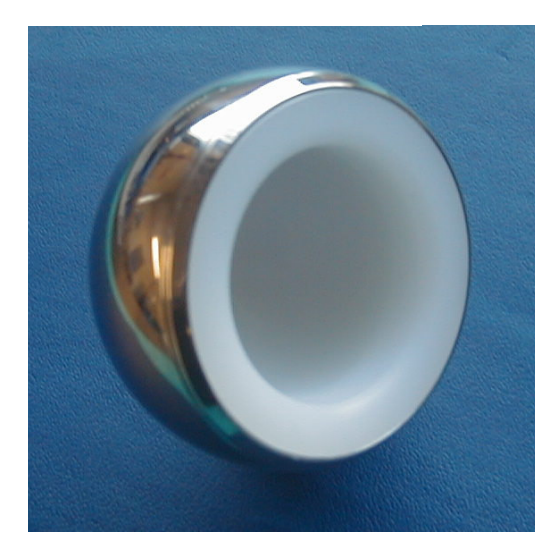
Locked press-assembled Bi-polar cup