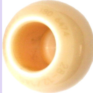
Cobalt-Chrome ISO5832-12 standard