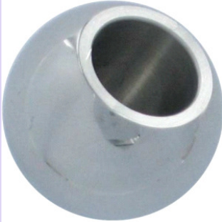
Stainless steel ISO5832-9 standard